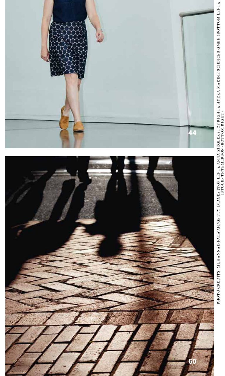
32 | OUT OF OPTIONS

In large crowds like that at the Hajj in Mecca, a mass panic leaves no chance of escape.