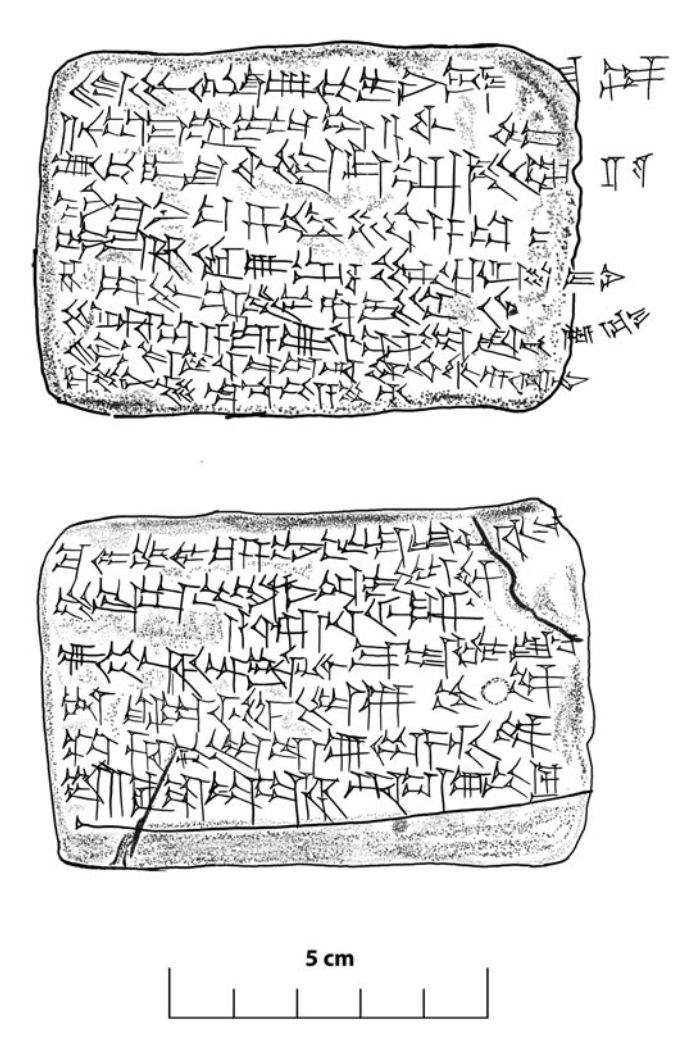
Fig. 3 Hand-copy of BM 108868 by N. Wasserman.